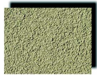
Khaki SF KI