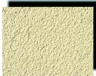
Almond SF AL