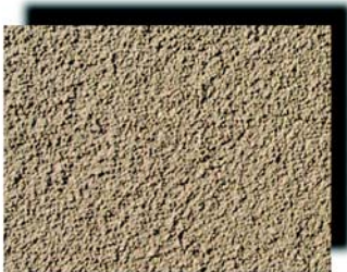
Clay SF CY