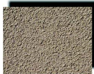
Adobe SF AB