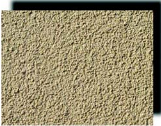
Autumn SF AT