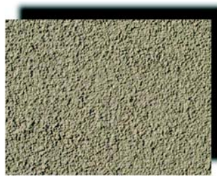
Tan SF TN