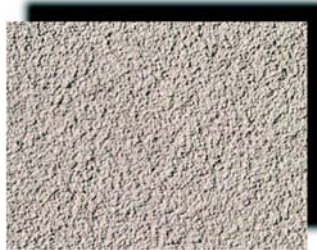
Lavender SF LV