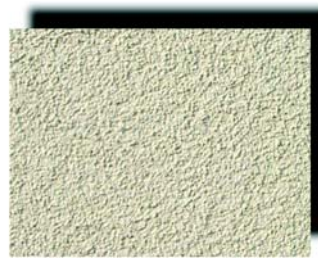
Navajo SF NJ