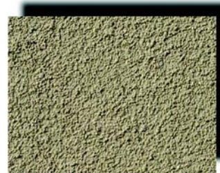
Malt SF MT