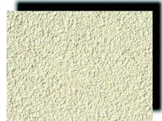
Oyster SF OY