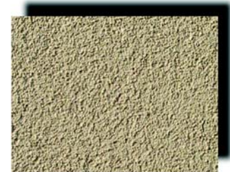
Champagne SF CP